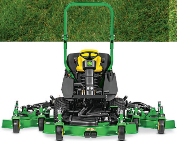
62 in. with center deck only