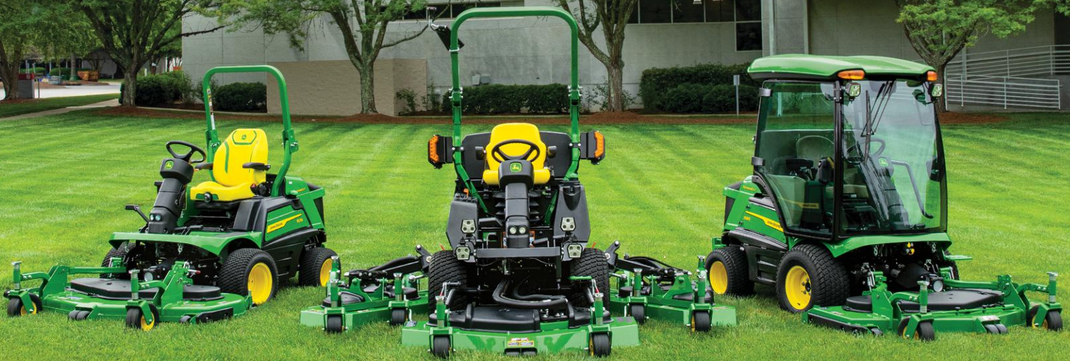
1570 TerrainCut™ Front Mower