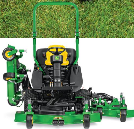
94 in. with center deck and either side deck