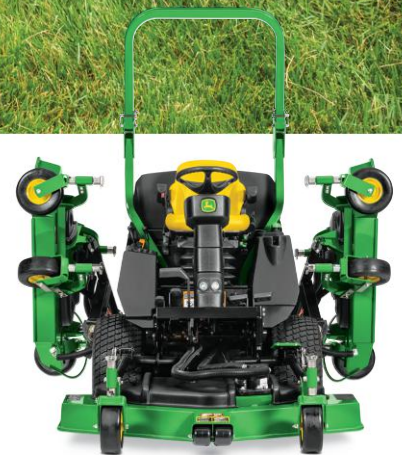
84-in. transport width with both sides folded in