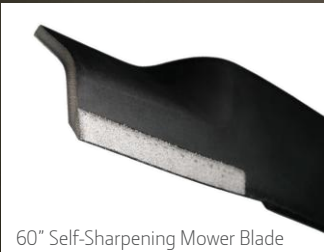
60" Self-Sharpening Mower Blade