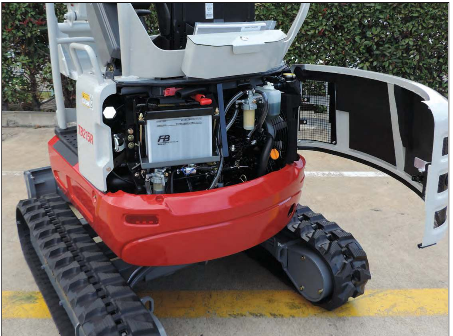
Easy Maintenance and Service Access

The TB215R is powerful, tough and versatile. This machine provides exceptional value and demonstrates outstanding performance.