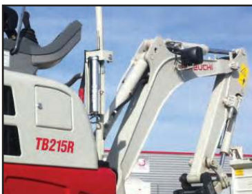
Top Mount Boom Cylinder