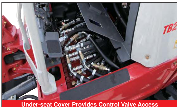
Under-seat Cover Provides Control Valve Access