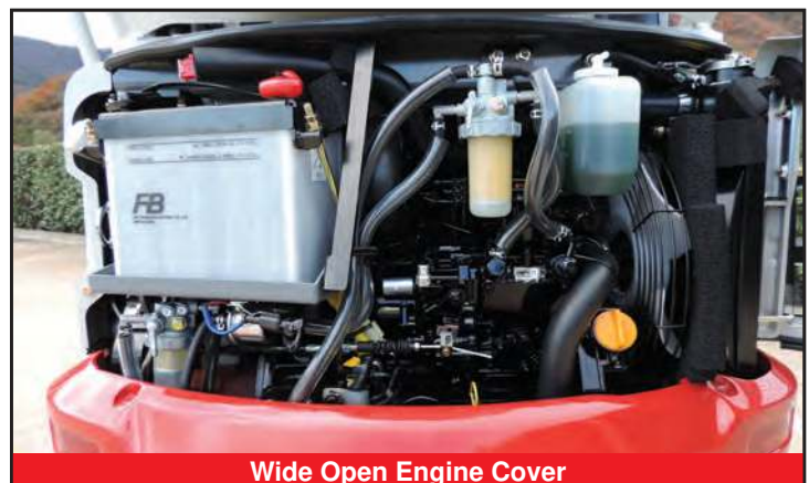
Wide Open Engine Cover

*Functions may not be available in all countries, so please consult your Takeuchi dealer for details.