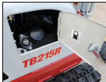
High Capacity Fuel Tank