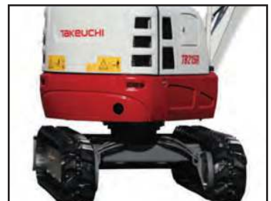
Short Tail Swing