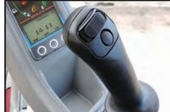
Hydraulic Joystick Controls